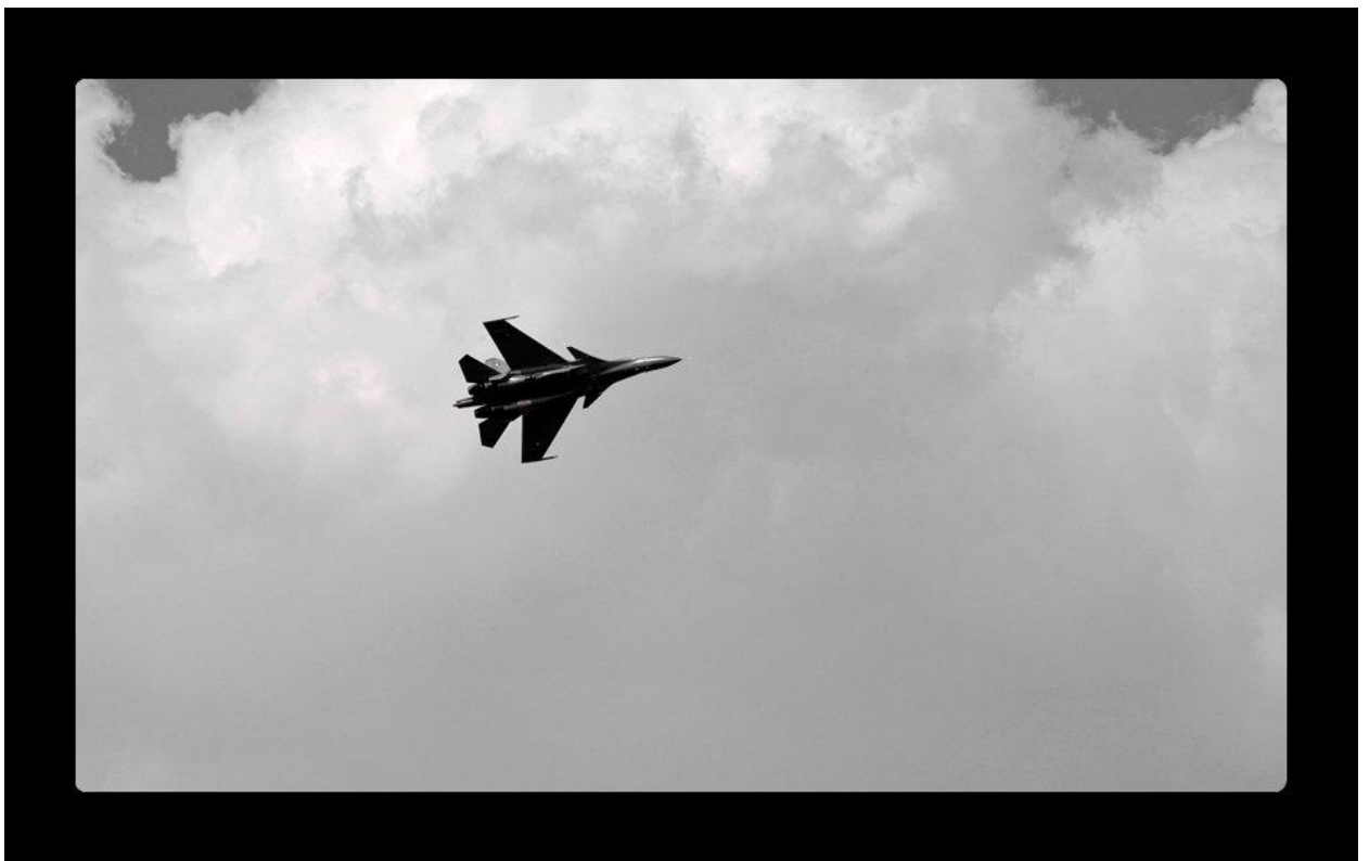
An F-16 performing the Aero India show 2013 in Yelahanka air base in Bangalore on Wednesday.