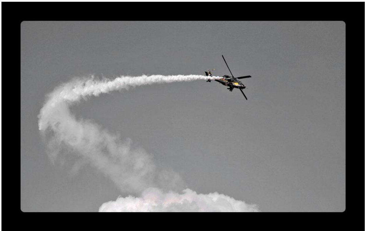
The weaponized version of the Indian-made Advanced Light Helicopter (ALH), also called Rudra at display in Aero India 2013. The Rudra is powered by twin Shakti engines and uses an integrated